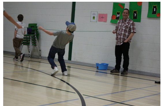
Jump Rope for Heart